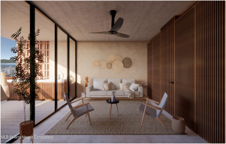
M/S Valeria Nayari Compostela