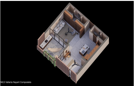
M/S Valeria Nayari Compostela