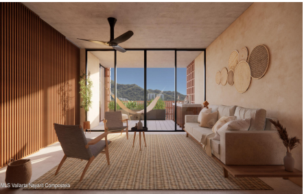
M/S Valeria Nayari Compostela