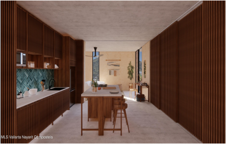
M/S Valeria Nayari Compostela