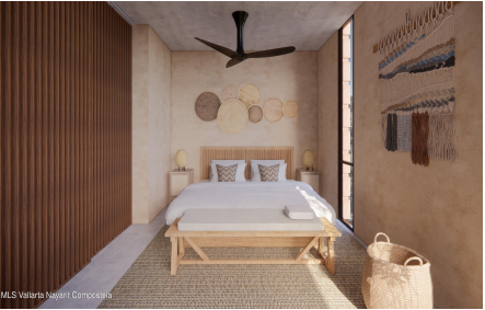
M/S Valeria Nayari Compostela