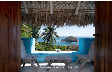
Bedroom One Main Terrace