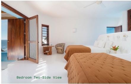
Bedroom Two-Side View