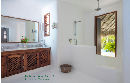
Bedroom One Bath & Private Terrace