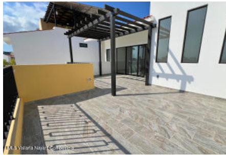
M.S. Valera Nayarit Composites