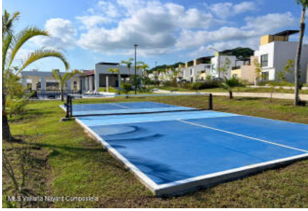
M.S. Valera Nayarit Composites