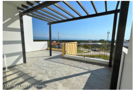
M.S. Valera Nayarit Composites