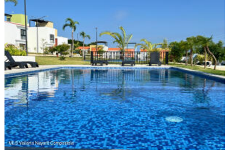
M.S. Valera Nayarit Composites