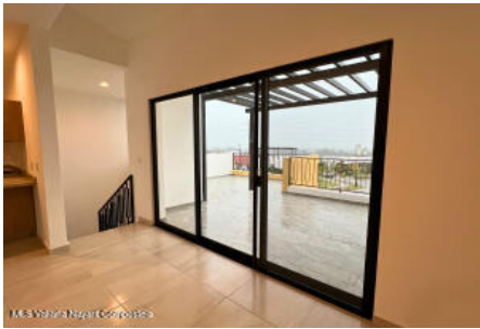
M.S. Valera Nayarit Composites