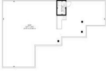
MLS Vallarta Nayarit Compostela Casa Escondida, Bucerias