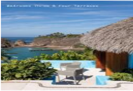
Bedroom Three & Four Terrace