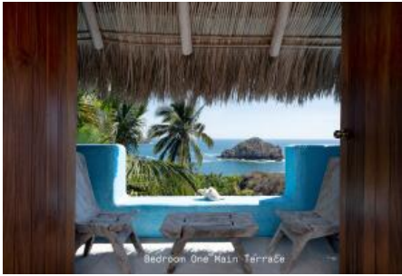
Bedroom One Main Terrace