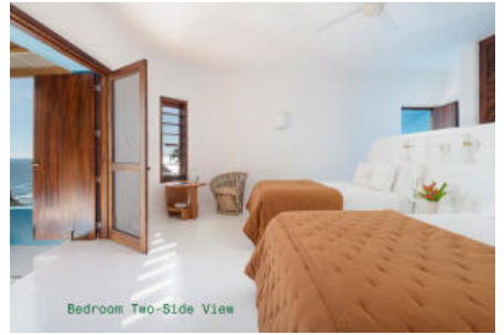
Bedroom Two-Side View