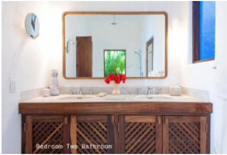
Bedroom Two Bathroom