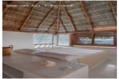
Bedroom Six & 7 Terrace