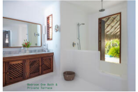
Bedroom One Bath & Private Terrace