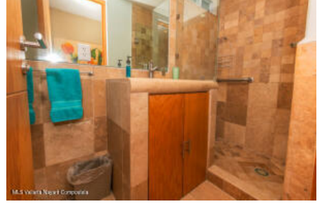
M.S. Viana Real Estate