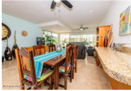
M.S. Viana Real Estate