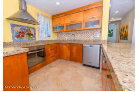
M.S. Viana Real Estate