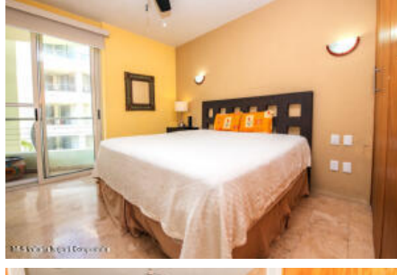
M.S. Viana Real Estate