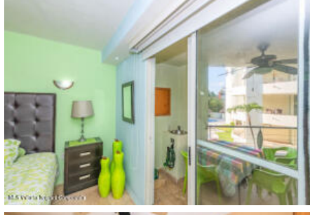
M.S. Viana Real Estate