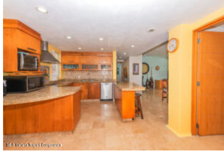
M.S. Viana Real Estate