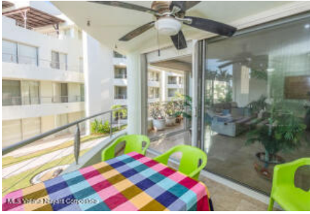
M.S. Viana Real Estate