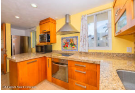
M.S. Viana Real Estate