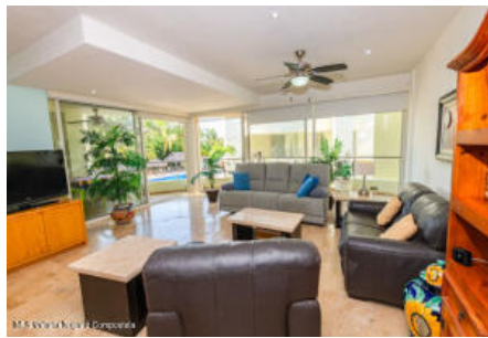
M.S. Viana Real Estate