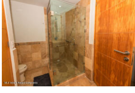
M.S. Viana Real Estate