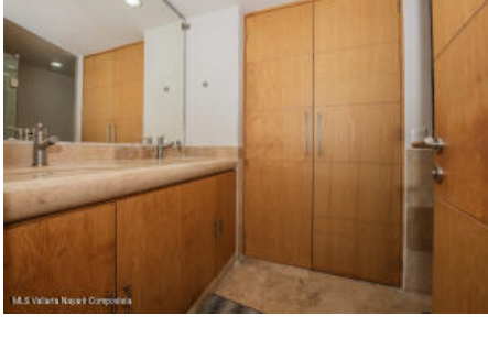
M.S. Viana Real Estate