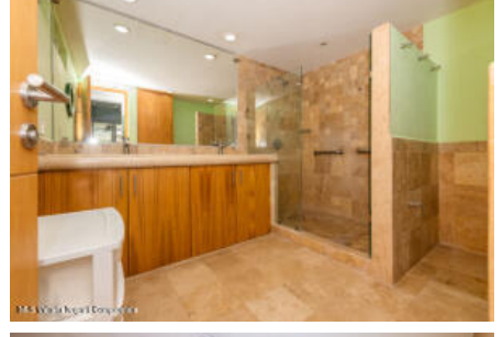
M.S. Viana Real Estate