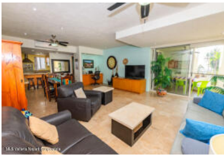
M.S. Viana Real Estate