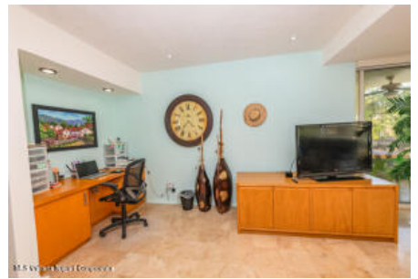
M.S. Viana Real Estate