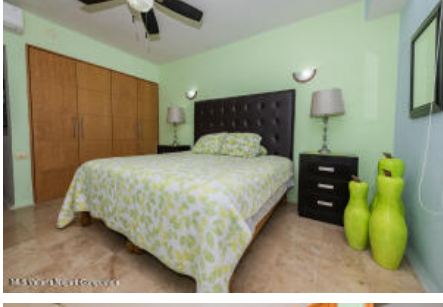
M.S. Viana Real Estate