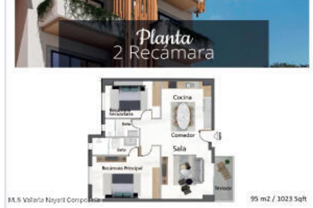
M.S. Valeria Negrete Compañía 95 m2 / 1023 Sqft