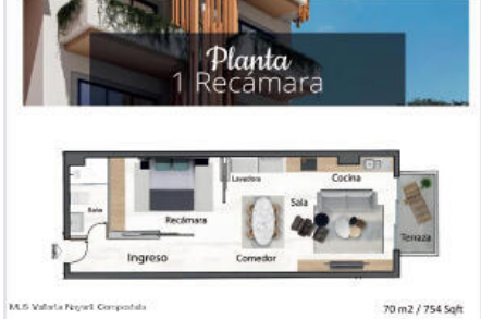
M.S. Valeria Negrete Compañía 70 m2 / 754 Sqft