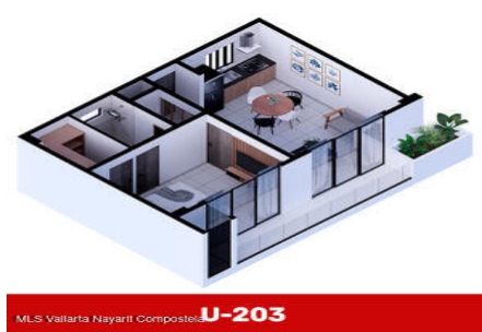
MLS Vallarta Nayari Compostel U-203