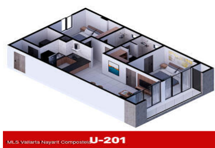
MLS Vallarta Nayari Compostel U-201