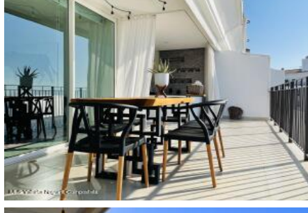
MLS Vallarta Nayart Compostela