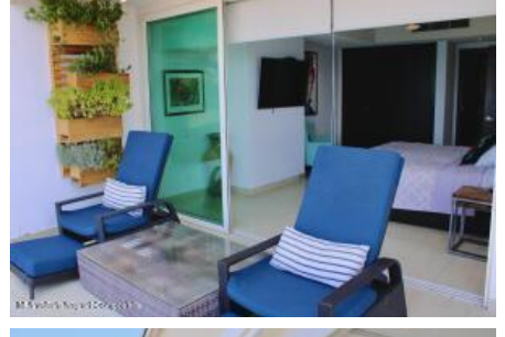
MLS Vallarta Nayart Compostela