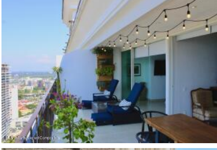
MLS Vallarta Nayart Compostela