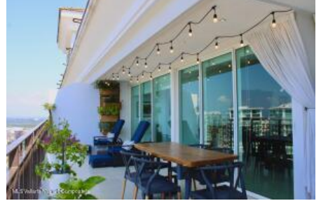
MLS Vallarta Nayart Compostela