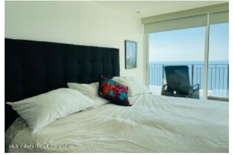
MLS Vallarta Nayart Compostela