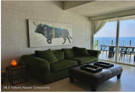
MLS Vallarta Nayart Compostela