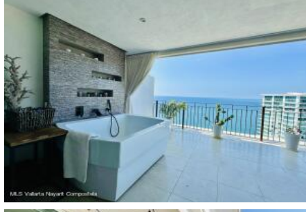
MLS Vallarta Nayart Compostela