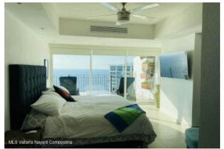
MLS Vallarta Nayart Compostela