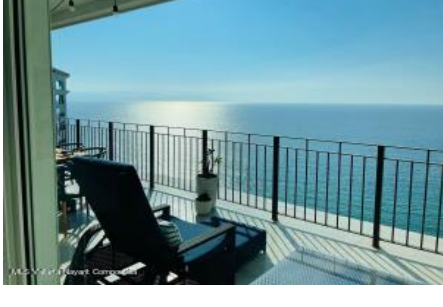
MLS Vallarta Nayart Compostela