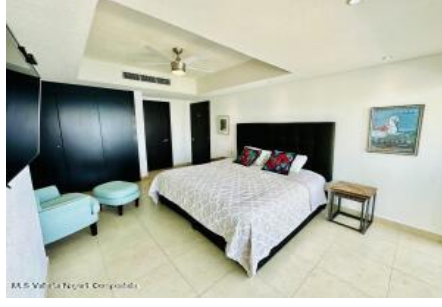
MLS Vallarta Nayart Compostela