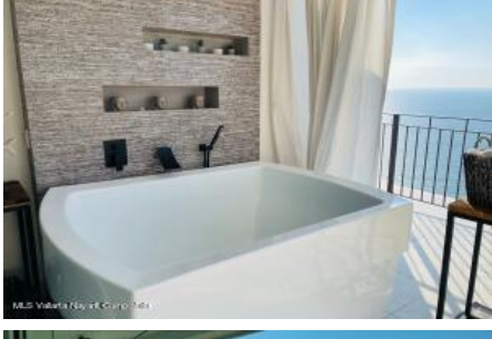
MLS Vallarta Nayart Compostela