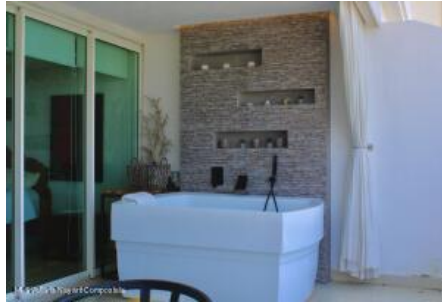
MLS Vallarta Nayart Compostela