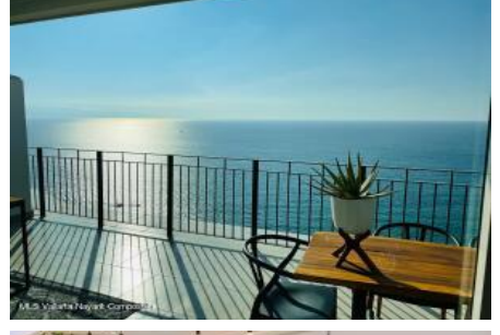
MLS Vallarta Nayart Compostela