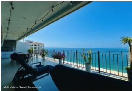
MLS Vallarta Nayart Compostela