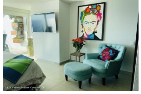
MLS Vallarta Nayart Compostela