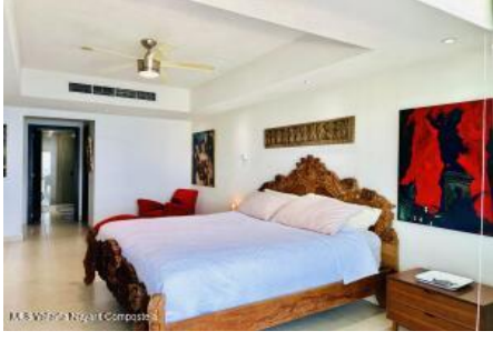
MLS Vallarta Nayart Compostela