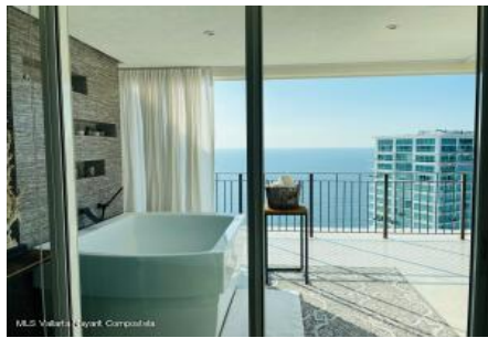
MLS Vallarta Nayart Compostela