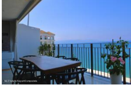
MLS Vallarta Nayart Compostela