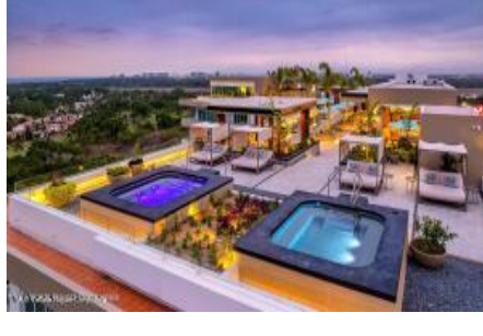
M.M. Vivas Negral Corporativa