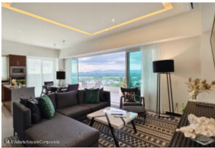
M.M. Vivas Negral Corporativa