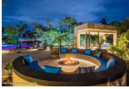
M.M. Vivas Negral Corporativa