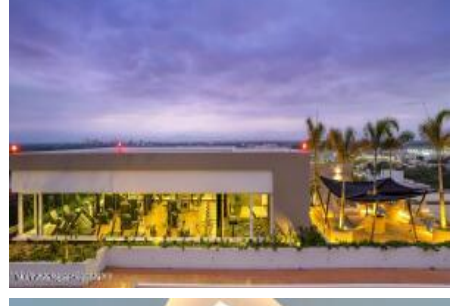
M.M. Vivas Negral Corporativa