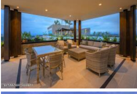
M.M. Vivas Negral Corporativa