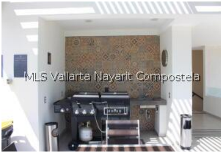
MLS Vallarta Nayarit Compostela