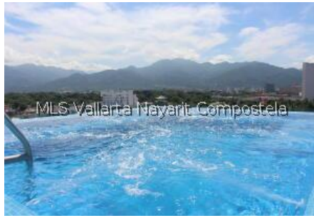
MLS Vallarta Nayarit Compostela