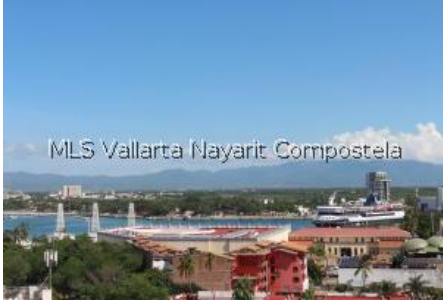
MLS Vallarta Nayarit Compostela