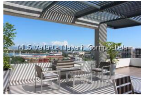
MLS Vallarta Nayarit Compostela