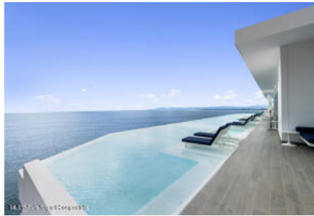
M.S. Vazquez Real Estate