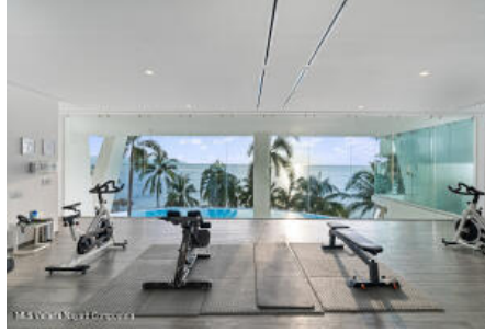
M.S. Vazquez Real Estate