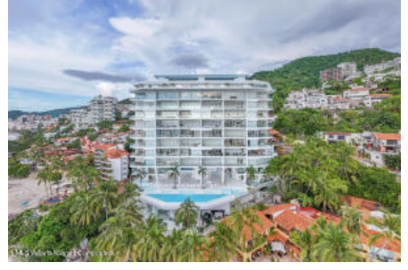
M.S. Vazquez Real Estate