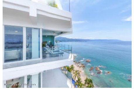
M.S. Vazquez Real Estate