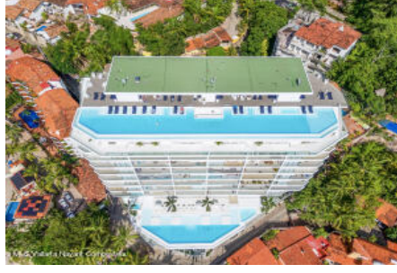
M.S. Vazquez Real Estate