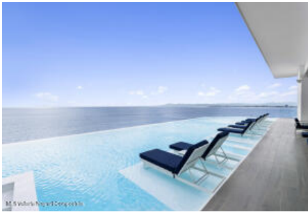
M.S. Vazquez Real Estate