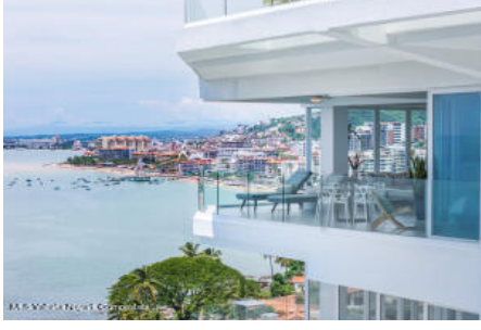
M.S. Vazquez Real Estate