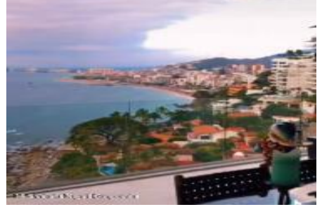
M.S. Vazquez Real Estate