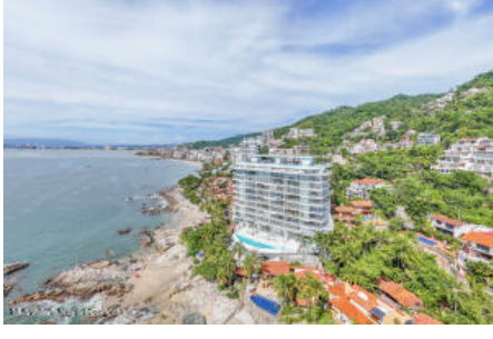
M.S. Vazquez Real Estate