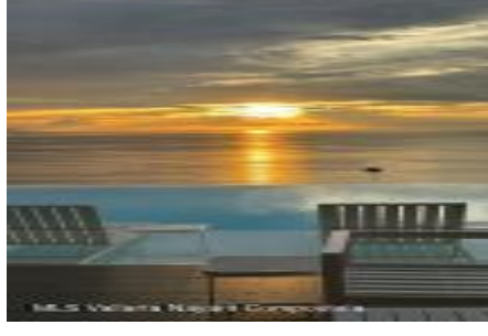
M.S. Vazquez Real Estate