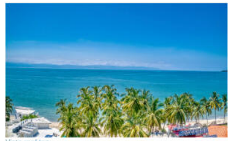
Vista roof top