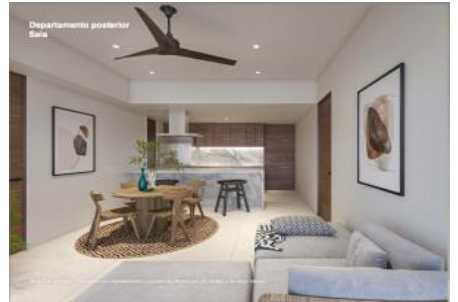
Departamento posterior Sala