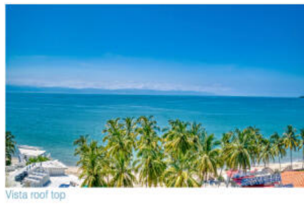
Vista roof top