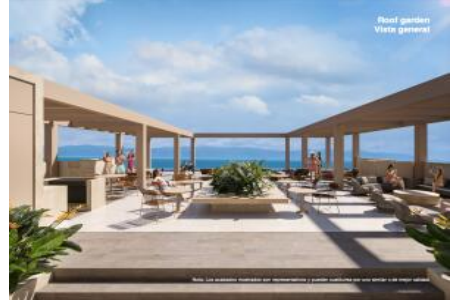
Roof garden Vista general