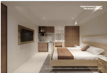
Departamento frontal Recámara y escritorio