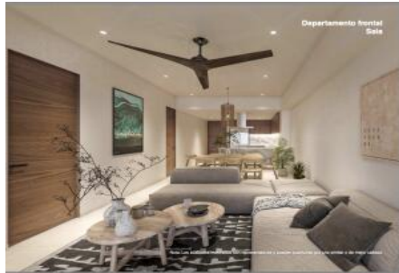
Departamento frontal Sala