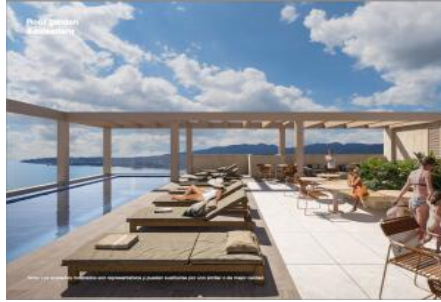
Roof garden Vista general