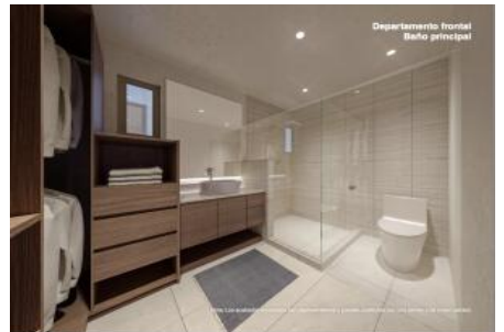
Departamento frontal Baño principal