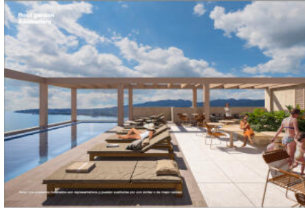
Rooft garden Subterráneo