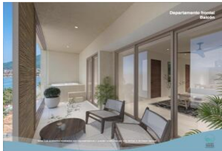
Departamento frontal Balcón