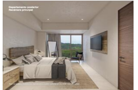
Departamento posterior Recámara principal