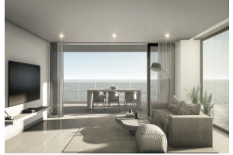
M3 World Next Compostela