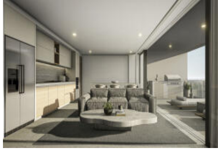
M3 World Next Compostela