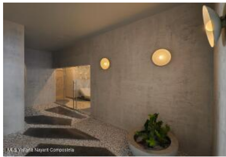
M3 World Next Compostela