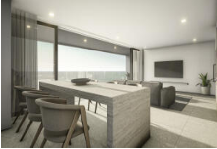
M3 World Next Compostela