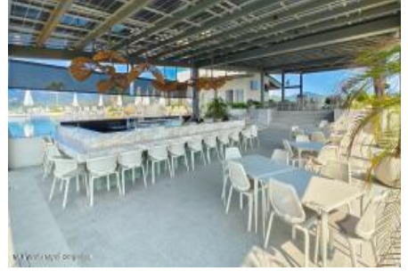
M3 World Next Compostela