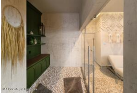
M3 World Next Compostela