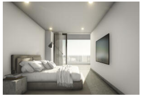
M3 World Next Compostela