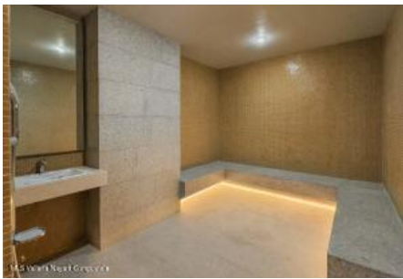
M3 World Next Crosslake