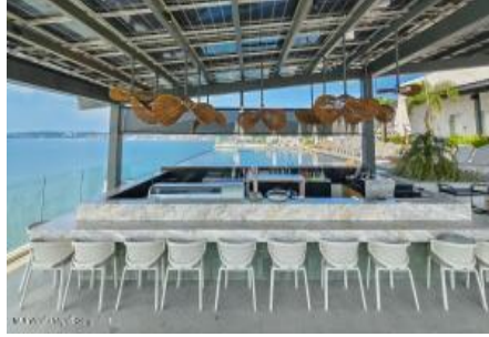
M3 World Next Compostela