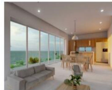
RENDER INTERIOR DPTO. EN NIVEL 4-5