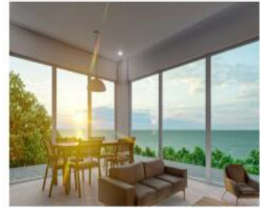
RENDER INTERIOR DPTO. EN NIVEL 1-2-3