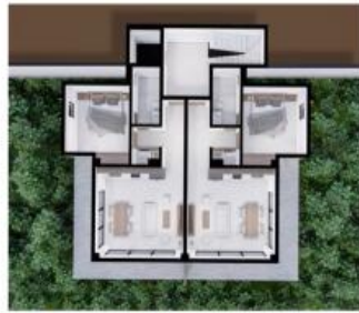
PLANTA NIVELES 1-2-3