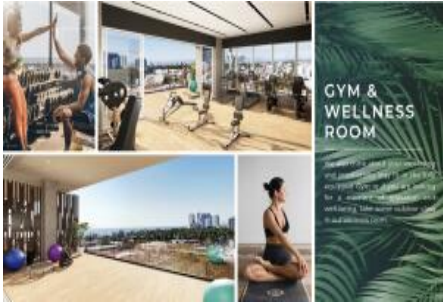
GYM & WELLNESS ROOM