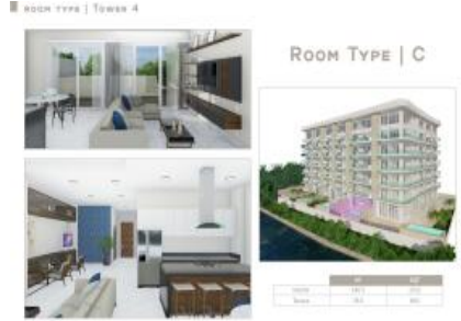
ROOM TYPE | Tower 4