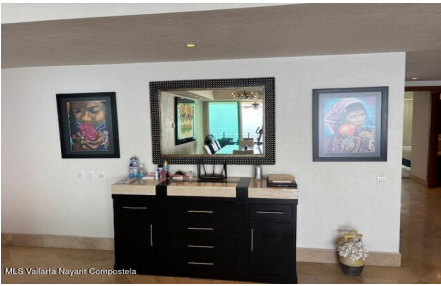
MLS Vallarta Nayari Compostela