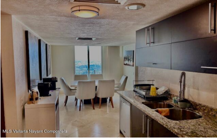
MLS Vallarta Nayari Compostela