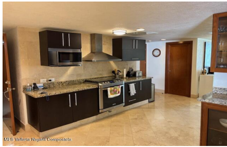
MLS Vallarta Nayari Compostela