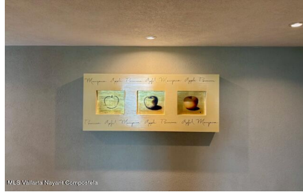
MLS Vallarta Nayari Compostela