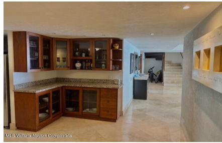
MLS Vallarta Nayari Compostela