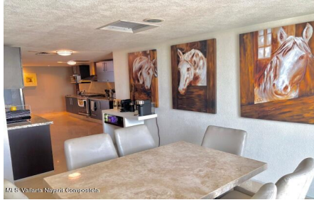
MLS Vallarta Nayari Compostela