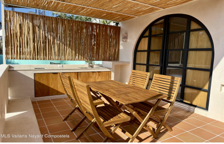
MLS Vallarta Nayarit Compostela