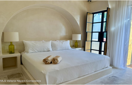
MLS Vallarta Nayarit Compostela