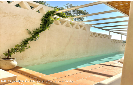
MLS Vallarta Nayarit Compostela