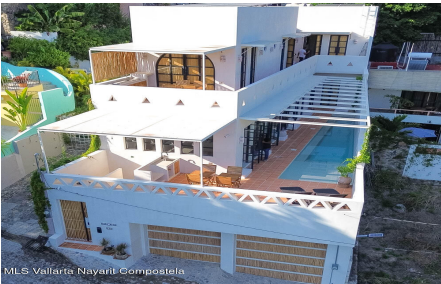
MLS Vallarta Nayarit Compostela