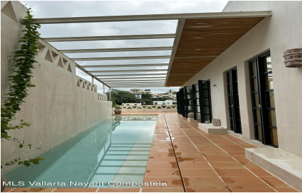
MLS Vallarta Nayarit Compostela