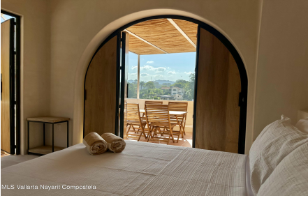
MLS Vallarta Nayarit Compostela