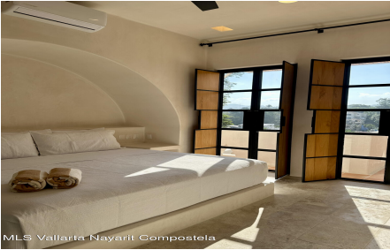
MLS Vallarta Nayarit Compostela