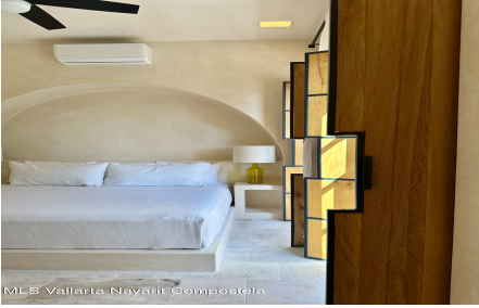
MLS Vallarta Nayarit Compostela