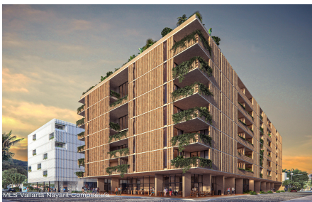
GRACIA 1 2 BED, 2 WC

Contact the listing agent for an ADDITIONAL 20% DISCOUNT on this unit!!! Ofrenda presents a prime real estate investment opportunity due to its central location, modern-Mexican design, and Grupo Gova's esteemed reputation. The architectural concept is inspired by Mexico's rich heritage, utilizing beautiful local materials and a construction style that exudes surprise with every detail. The property boasts raw finishes, natural materials, excellent ventilation, and ample natural light, creating a harmonious living space. Key features include large terraces, basement storage units, underground parking, a fully equipped gym for fitness enthusiasts, and a sky terrace furnished to perfection.