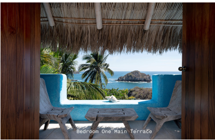
Bedroom One Main Terrace