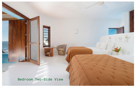
Bedroom Two-Side View