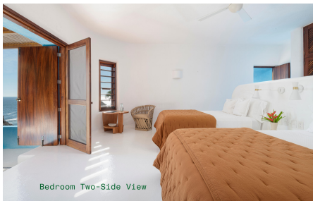
Bedroom Two-Side View