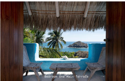
Bedroom One Main Terrace