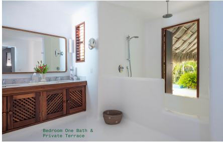
Bedroom One Bath & Private Terrace