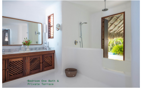
Bedroom One Bath & Private Terrace